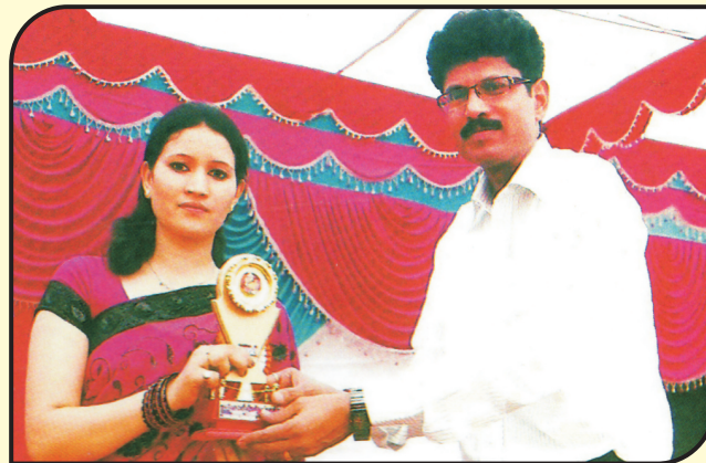
Best Teacher of the School Awarded by Chairman year 2008-09