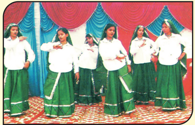
Girls Performing Folk Dance Haryana on the eve of Annual Function