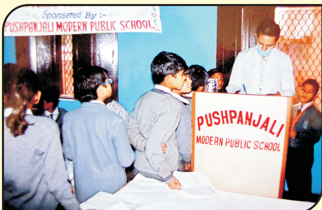
Thoroughly medical Check-up of the students with the collaboration of NGO after every Six Months.