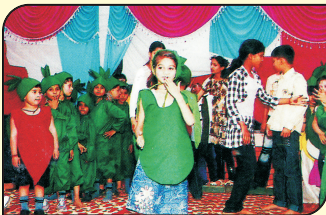
Our Little Stars Preforming Dance on Independence Day.