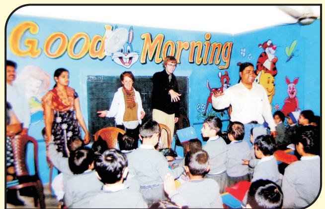
American Delegates listening poems recited by Nursery Kids.