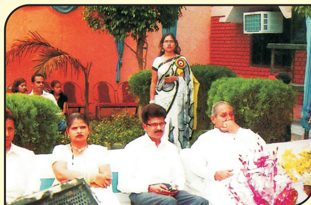
Chief Guests Sitting and Praising the Students On the Annual Day Function