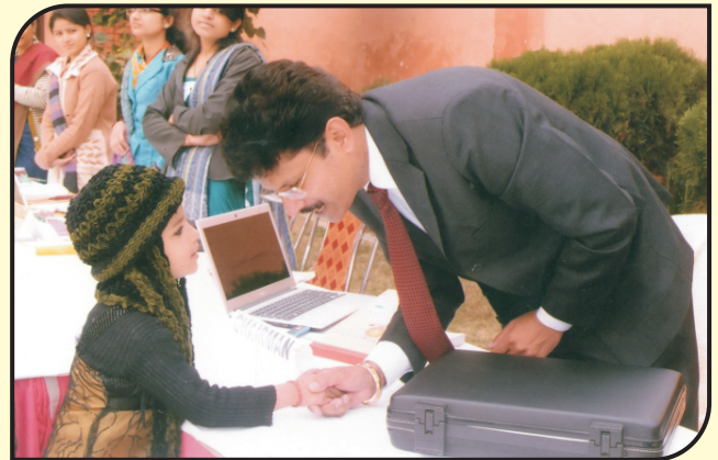
A student whispering Hon'ble Chairman about the magical effects of miraculous words said during monthly counseling by himself.