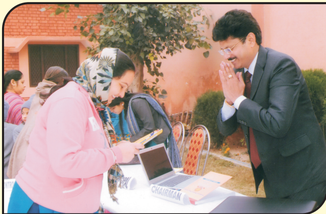
Hon'ble Chairman welcoming parents and thanking them for their cooperation to make the Meeting successful.