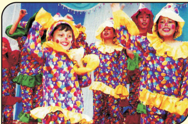
Kids on Fancy Dress Competition On Children's Day