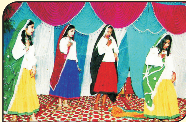
Girls Performing Folk Dance of Rajasthan on the eve of Annual Function.