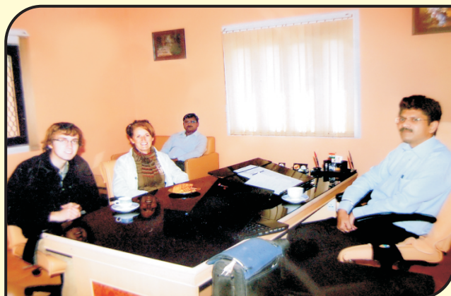
American Delegates Having a Keen Desire Visiting Hon'ble Chairman in order to know more about the quality Education.