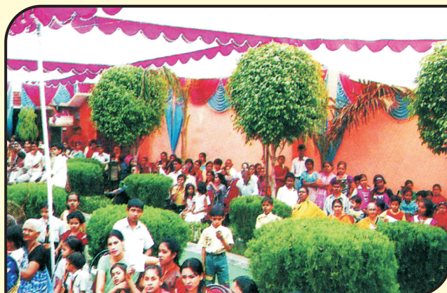
Large Gathering on the Occasion of Annual Day Function